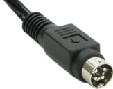
YL4 Type (KPPX-4P)