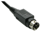
YL3 Type (KPPX-3P)