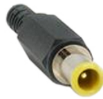
EJ1/2/3/4/5 (EIAJ RC-5320A type connectors)