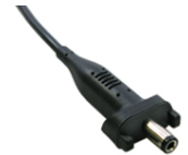
Inquire for custom design

For a comprehensive list of options, click here