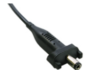
Inquire for custom design

For a comprehensive list of options, click here